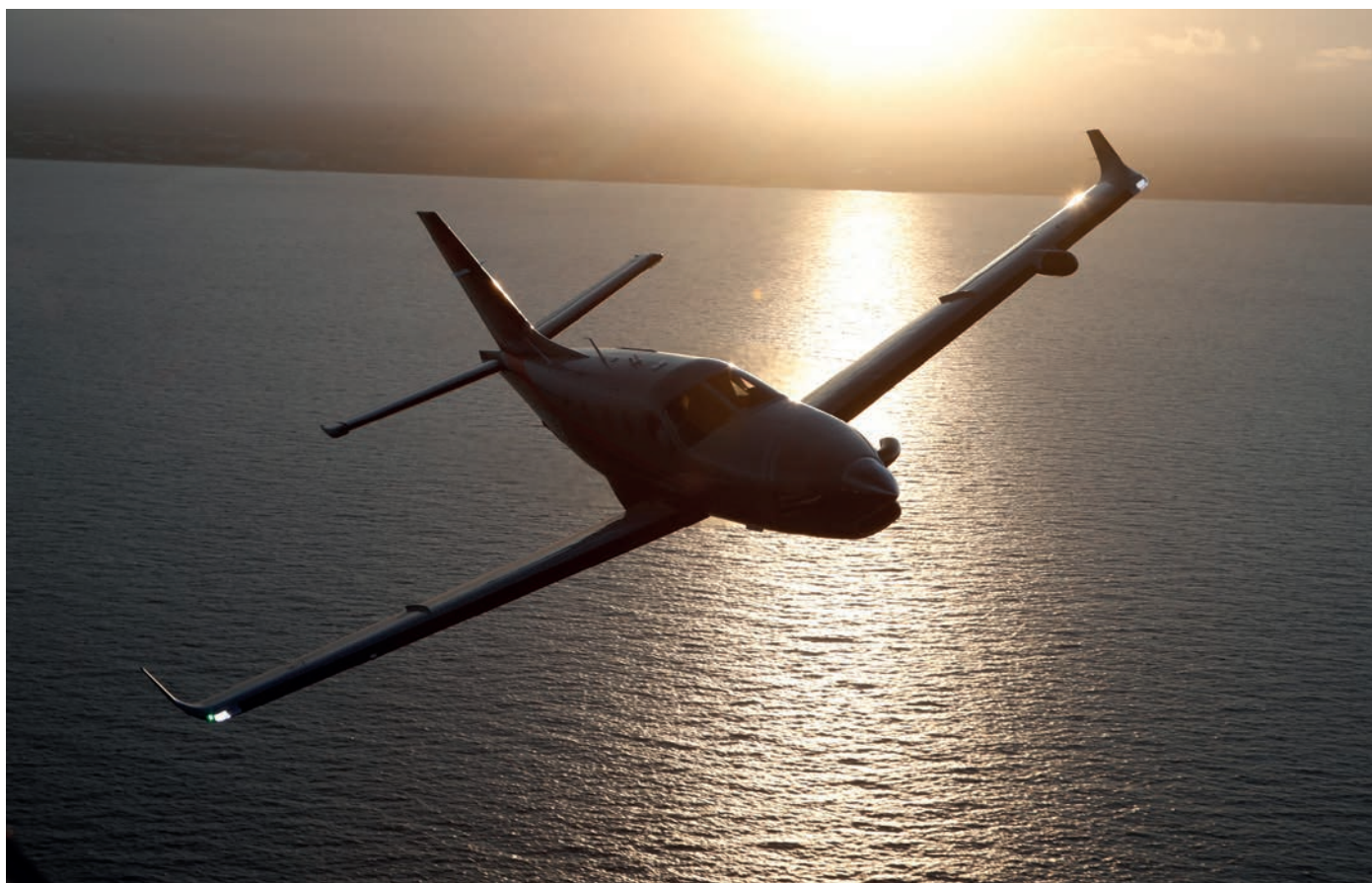
Bank past 45 degrees, and roll servos will bring you back to upright