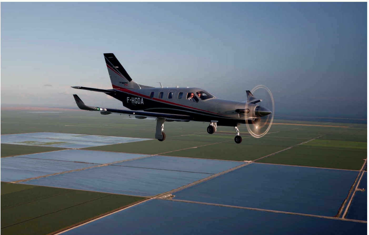
With a range of 1,730 nm the 940 is perfect for channel hops and trips further afield

With the heat of the day, a line of build-ups came between us and Florida's east