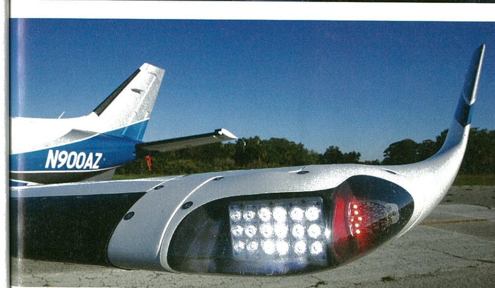
Landing lights have moved to the wingtip, and inner gear doors reduce drag on the TBM 900.