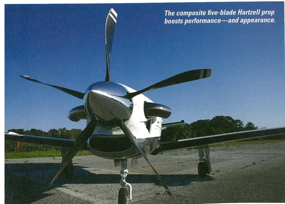
The composite five-blade Hartzell prop boosts performance—and appearance.

A significant percentage of TBM buyers fall into the 500 to 1,000 total-flight-hour range, according to John Warnk, instructor and program manager for TBM training at Simcom, an FAA-approved initial and recurrent training provider for TBM series aircraft (see sidebar). Many such owners transition directly from high-performance piston aircraft without any turboprop experience, and the 900 should be an easier adjustment than earlier TBMs. “A great thing in the 900 is that we have a semi-automatic start procedure,” Luy